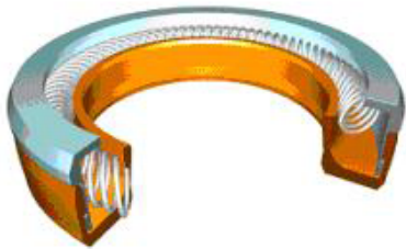
KS Rotary Bal Seal®