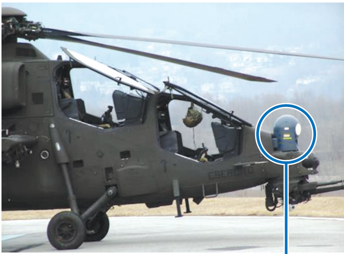
Rotating electro-optical turret

The Bal Seal® spring-energized low friction seal offers an ideal solution for gimbals, pods, turrets, and pan-tilt systems used on aircraft and other platforms. Its seal jacket is typically constructed of specially formulated polymer-filled polytetrafluoroethylene (PTFE) materials that provide exceptional sealing performance and an extremely low dynamic coefficient of friction. Additionally, its Bal Spring® canted coil spring energizer exerts a customizable, near-constant force that helps compensate for wear and ensures long service life.